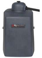
Swing Gate Operator

HySecurity operators secure the world's critical infrastructure and key assets where ultimate reliability is vital. SwingSmart DC delivers that same uncompromising quality to commercial customers, where ease of use, consistent operation, low maintenance, long life and high reliability is expected.